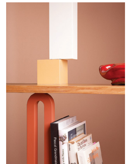
STEPHANY HILDEBRAND X4